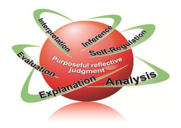
Figure 1. Process of Critical Thinking Skills

Critical thinking occurs through processes, stages, logical and concrete. Critical thinking process is divided into six skills, namely interpretation (Interpretation), analysis (Analysis), evaluation (Evaluation), conclusion (Inference), explanation (Explanation) and self-regulation (Self-regulation). Facionne<sup>6</sup> explained that the process of critical thinking skills can be described as follows: